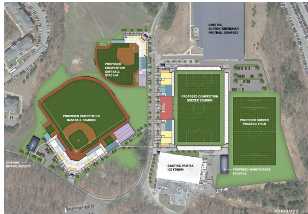
Site Plan, Soccer to right, Baseball & Softball to left

Study by Populous Architects; in fundraising phase