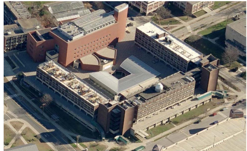
Gant Building, looking East

Goody Clancy & Mitchell Giurgola Architects CM interviews October, on board November 2015