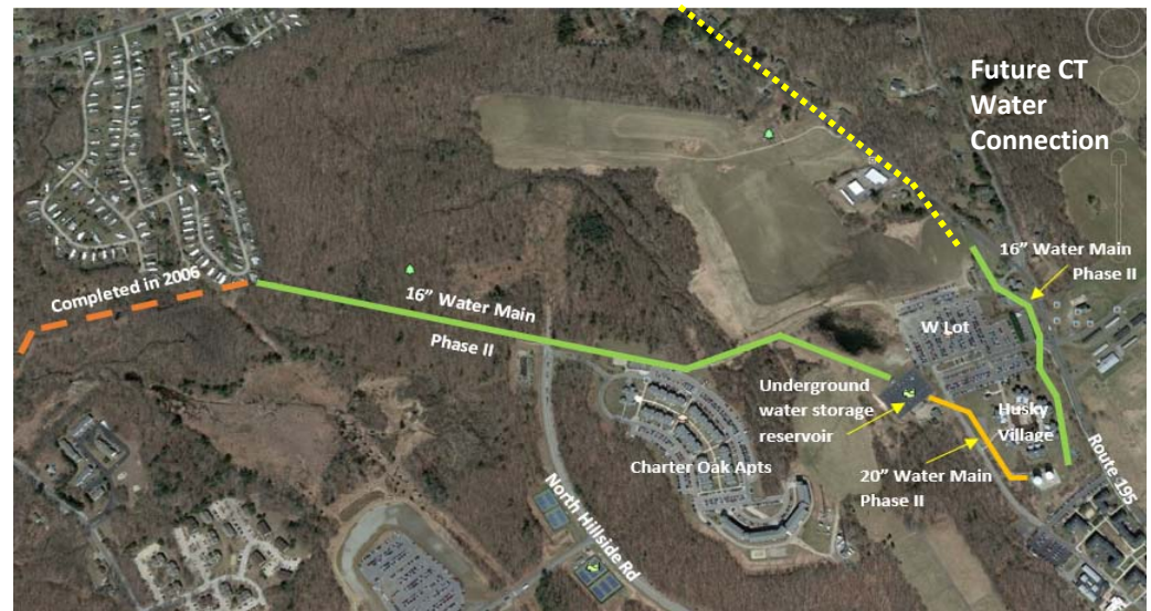
North Campus Site Plan

AECOM Engineers; CM pre-quals complete, on board Nov 2015 10